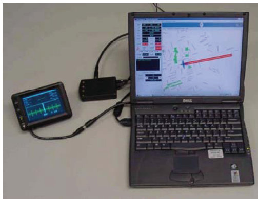
Typical system, showing included pilot display with Course Deviation Indicator

ALTM-NAV is included with all new ALTM systems or it can be purchased separately for existing ALTM systems